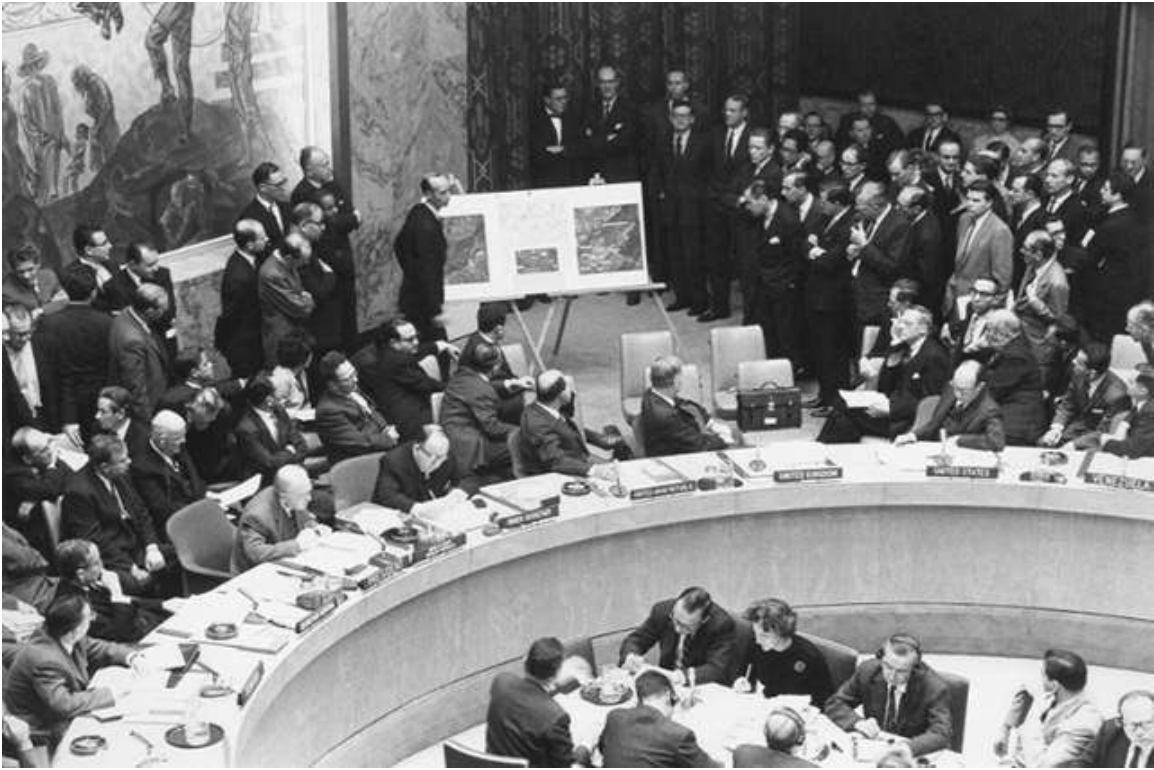
Adlai Stevenson shows aerial pictures of Cuba to the United Nations, November 1962. Photograph: United Nations Library. Hosted by the National Air and Space Museum online at http://www.nasm.si.edu/exhibitions/lac/images/LE283L5A.jpg