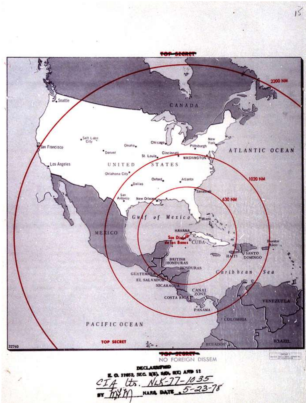
Map used in secret meetings about the Cuban Missile Crisis, October 16, 1962.